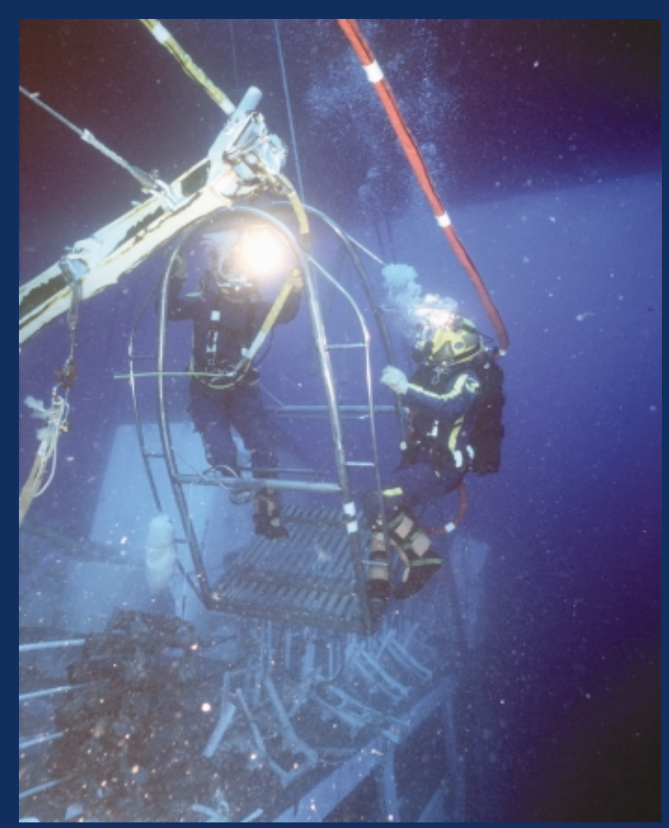
U.S. Navy and Japanese divers prepare to jump from their stage to the deck of EHIME MARU to salvage personal effects and remains from the vessel off Honolulu International Airport's Reef Runway.

On 14 October 2001, the EHIME MARU was relocated to the Shallow Water Relocation Site (SWRS) off Reef Runway. MDSU ONE, aboard the Crowley 450-10 barge, sailed from Pearl Harbor to