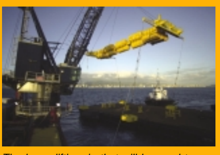
The lower lifting rig that will be used to relocate the sunken Japanese fishing vessel EHIME MARU is lifted from a barge off the coast of Oahu, Hawaii.

of the missing crewmembers, attention turned to locating the sunken vessel on the sea floor and searching it for trapped crewmembers. Due to the extreme depth. divers would not be able to be used. The Commander in Chief.