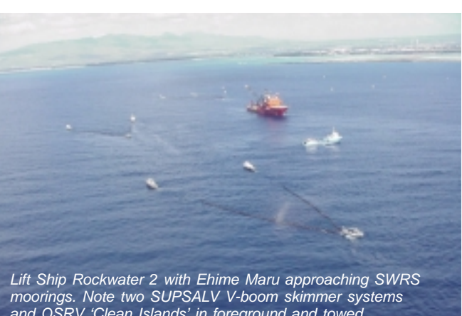
and OSRV 'Clean Islands' in foreground and towed containment boom astern of RW2.

reviewing Navy salvage plans and overseeing operations (generally through the FOSC or SOSC).